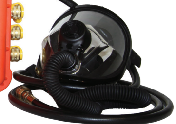
Typical Point of Attachment (POA) Set-up