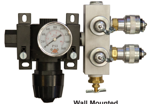
Wall Mounted Point of Attachment POA-4WM

A POA consists of a regulator, pressure gauge, safety relief valve, and fitting congruency necessary for proper respirator operation. A POA box can be located any distance from the Grade-D filtration Breather Box® or filtration panel. The remote air manifold (POA) assembly becomes the NIOSH attachment point for the respirator(s) and is now limited to a maximum 300 feet of breathing air hose at the air outlet fitting on the remote POA box. POA boxes may be taken into wet and/or hazardous locations. All our remote air manifolds meet NIOSH requirements of the 87-116 (1989) document for point of attachment.